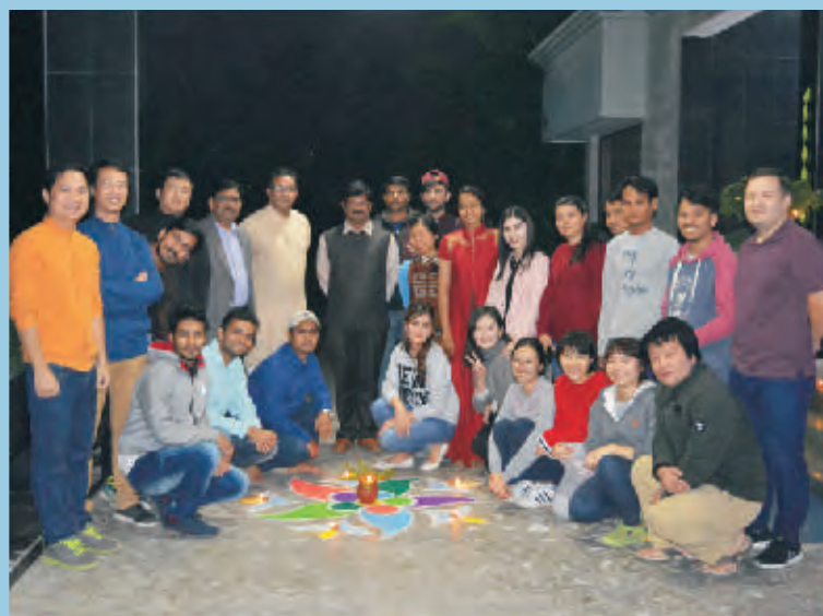
Students Celebrating Diwali (Festival of Lights) at IIRS, Dehradun

Phase-I of RS and GIS Course is divided into two Semesters. Semester-I is of 4 months duration and consists of module-I covering RS, image interpretations and analysis, Photogrammetry, GPS, GIS and environmental assessment & monitoring. Semester-II is of 5 months duration and consists of two modules, module-II of 2 months focuses on application of RS and GIS in thematic disciplines namely, Agriculture and Soil; Forest Ecosystem Assessment & Management; Geosciences & Geohazards; Marine & Atmospheric Science; Water Resources; Urban & Regional Studies; Satellite Image Analysis & Photogrammetry and Geoinformatics. In module-III of 3 months duration each scholar has to formulate and execute a Pilot Project under the guidance of the faculty. These three modules are described briefly ahead.