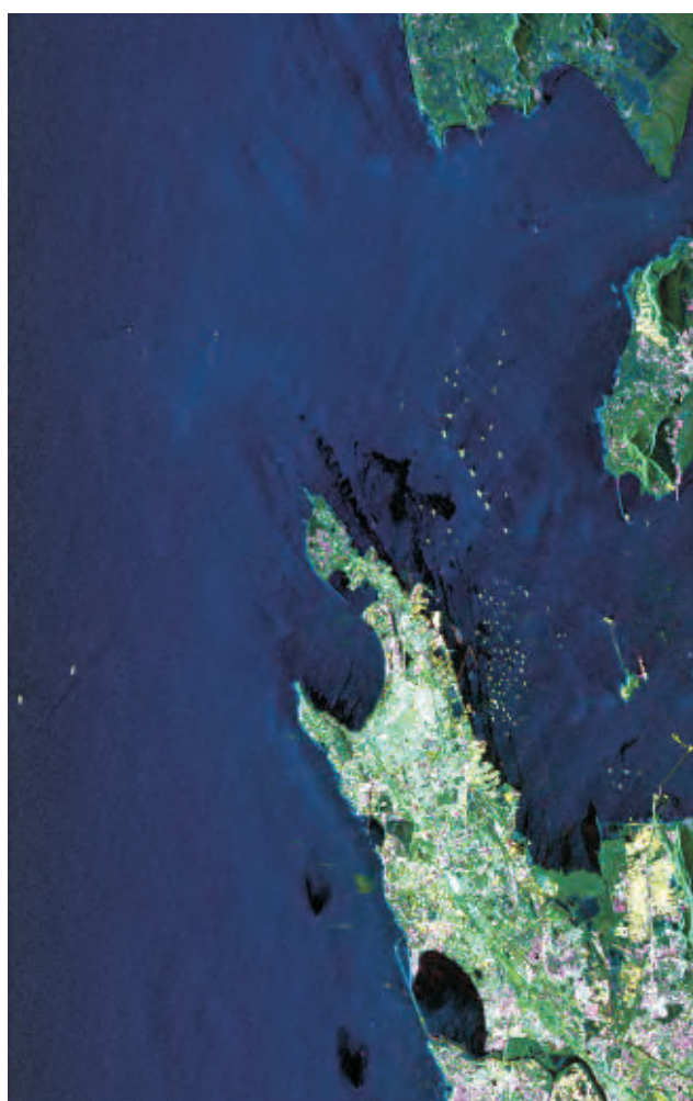
RISAT-1 FRS-2 mode Quad-Pol data over Mumbai, India