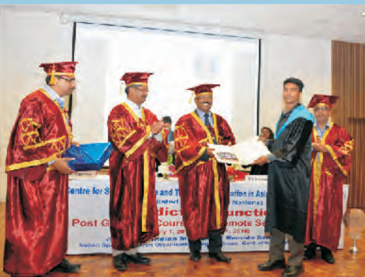
Students receiving certificates during valedictory function at IIRS, Dehradun