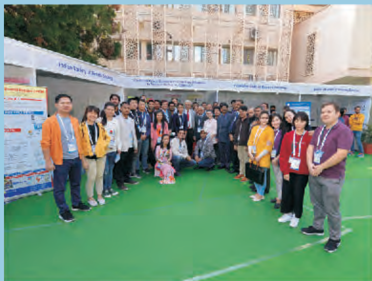
23 rd RS and GIS Tranees Participating in ISPRS TC V