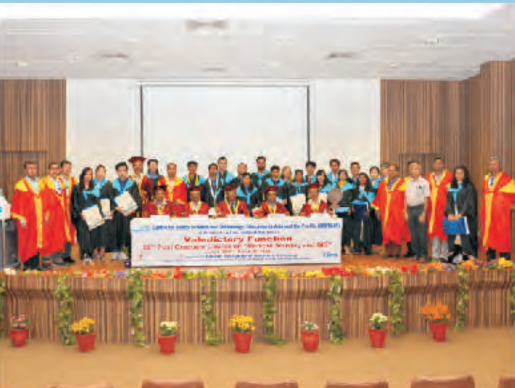
22 nd RS and GIS Course participants with dignitaries during the valedictory function conducted at IIRS, Dehradun

UNOOSA, Vienna, UNSPIDER, Beijing and UN-ESCAP, Bangkok have been providing financial assistance to CSSTEAP educational programmes and have extended travel grants to a good number of course participants since its inception. This contribution by UN Agencies is highly supportive to the overall activities of the Centre.