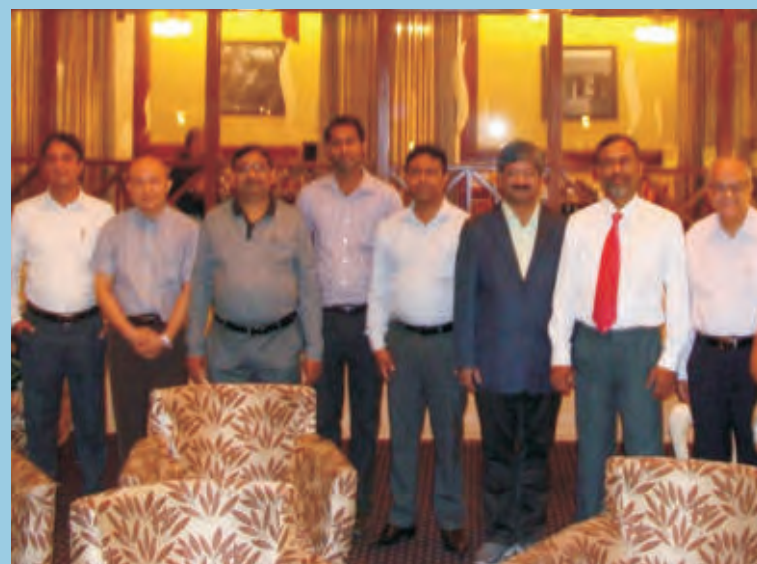
Alumini Meet at Colombo, Sri Lanka