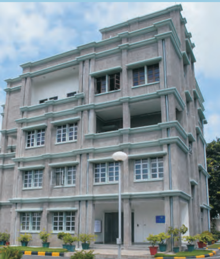
CSSTEAP Headquarters at Dehradun