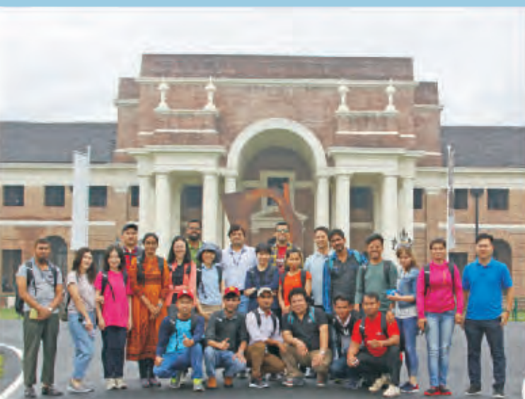
23 rd RS and GIS Participants during Visit to FRI, Dehradun