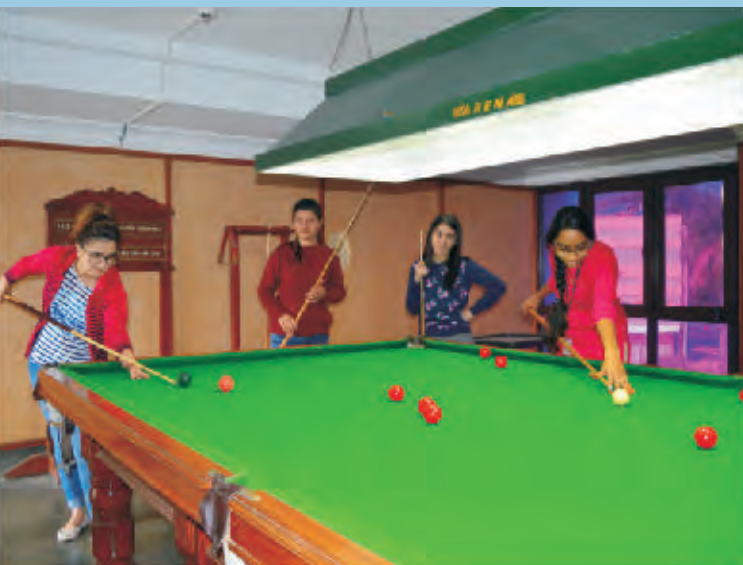
CSSTEAP Students playing Snooker