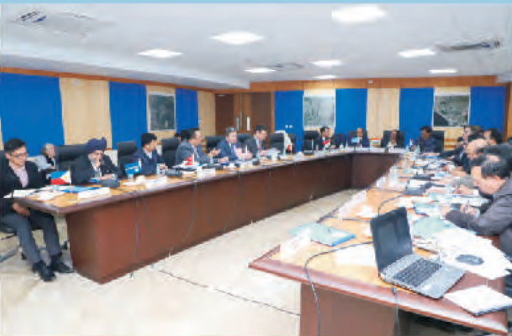
Governing Board Members during 23 rd GB Meeting chaired by Dr. K. Sivan, Chairman CSSTEAP GB