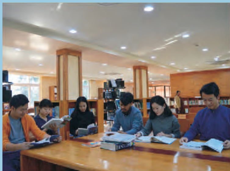
Students in Library