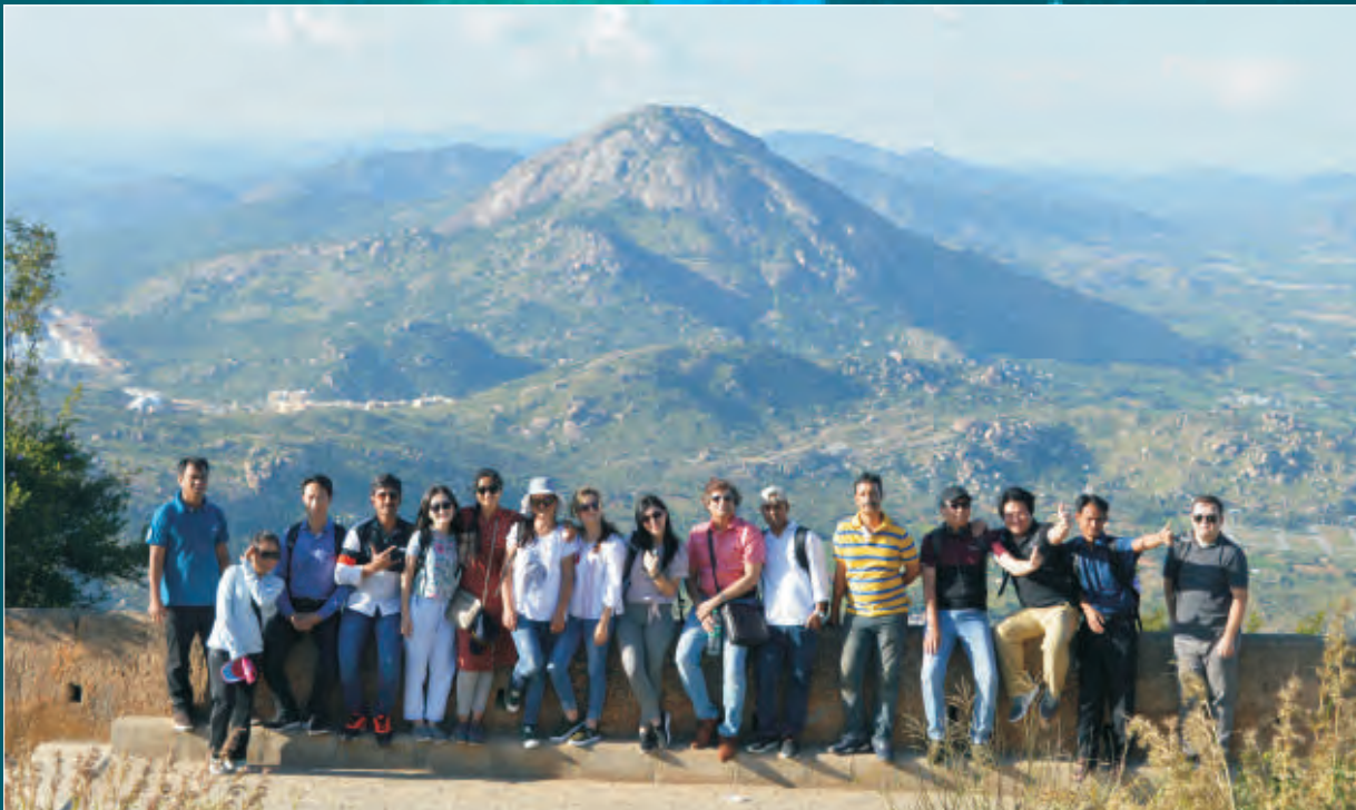
23 rd RS and GIS students during Educational Visits to Nandi Hills, Bangalore