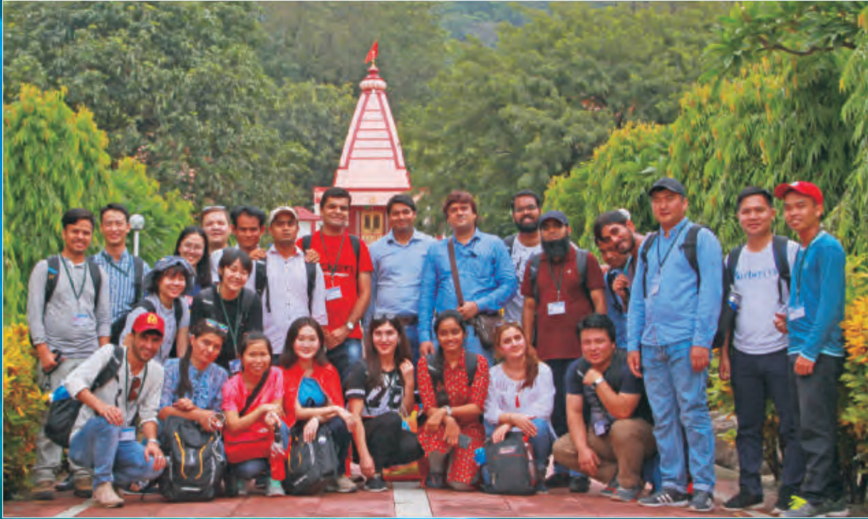
23 rd RS and GIS Course Participants during Field Visit to Rishikesh