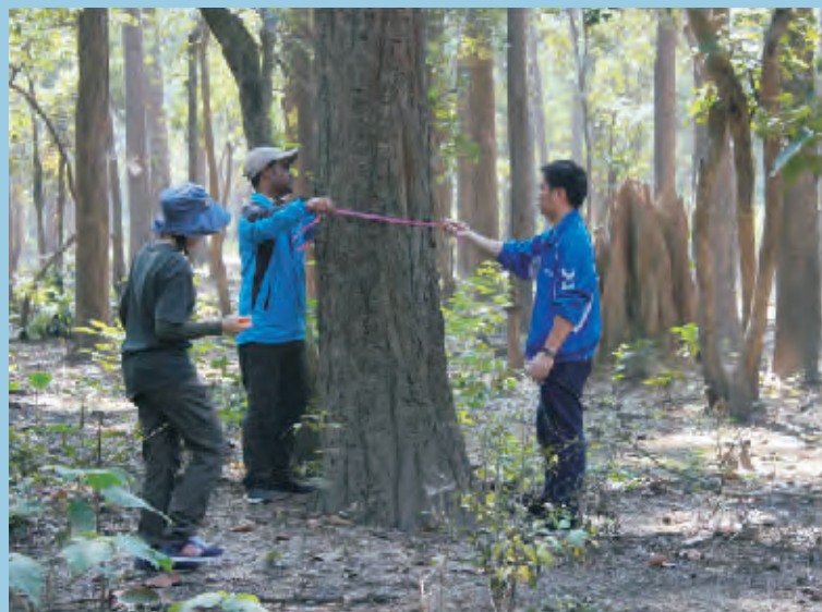
Students during Field work and data collection

As a part of the course curriculum, the participants will have the opportunity to visit different centres of ISRO / Dept. of