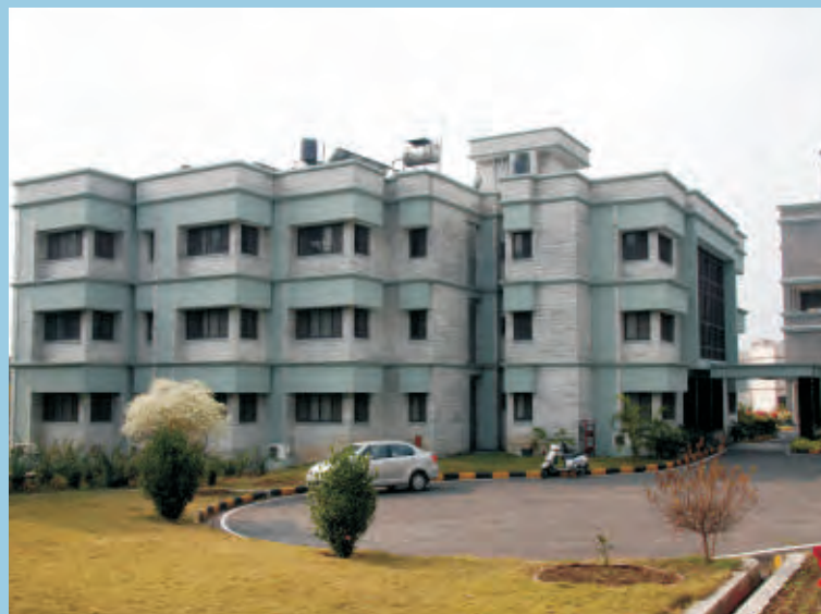
International hostel for course participants at IIRS Dehradun

To download application form or to know more about CSSTEAP, its past and future programmes, list of participants and countries who have benefitted from these and the Pilot Projects carried out through these programmes, please visit us at www.cssteap.org