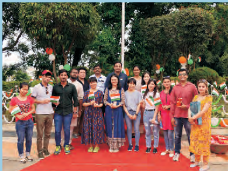
23 rd RS and GIS Tranees Participating in 72 nd Independence day of India on August 15

(ii) Master programme: This programme gives an opportunity and continuity in developing higher research skills for those who have completed successfully the nine months P.G. Course. This is subject to qualifying for admission requirements of Andhra University, India. A research project by the scholars is conducted and executed in their