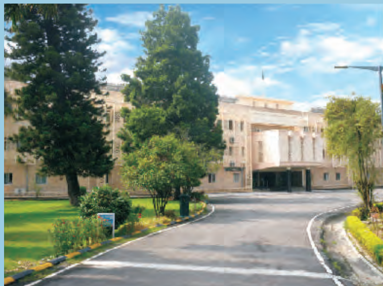
Indian Institute of Remote Sensing (IIRS) Campus, Dehradun