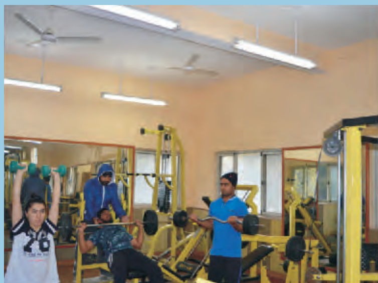
Students in Gym at IIRS, Dehradun