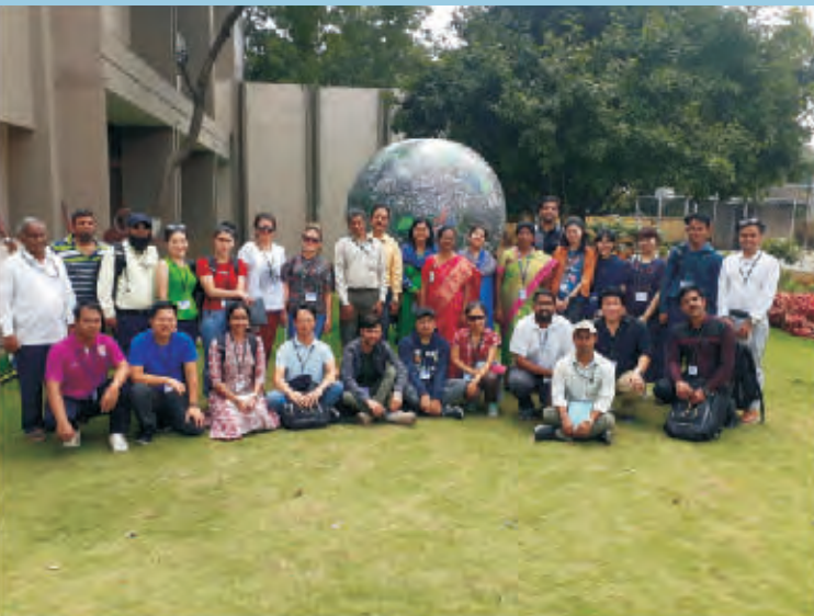
23 rd RS and GIS Participants during Technical Visit to NRSC, Hyderabad