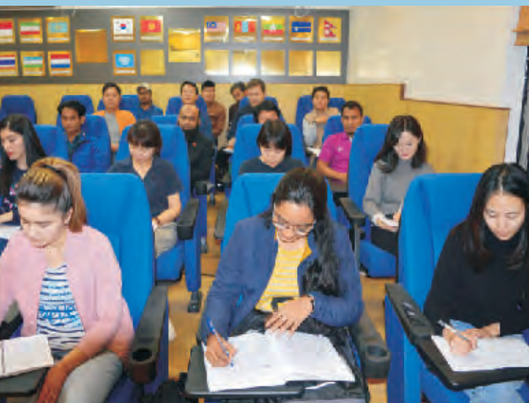
Students attending lectures in CSSTEAP Classroom