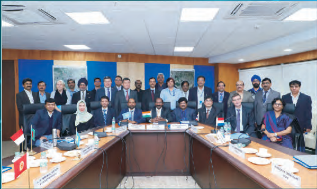
Governing Board Members and Special Invitees during 23 rd Governing Board Meeting at New Delhi, December 10, 2018