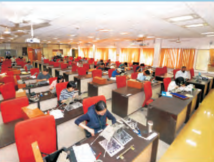
23 rd RS and GIS Students in the Practical Class