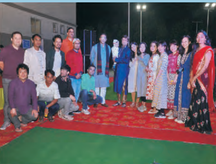
CSSTEAP Student Participating in the Cultural Event of Dandiya Raas