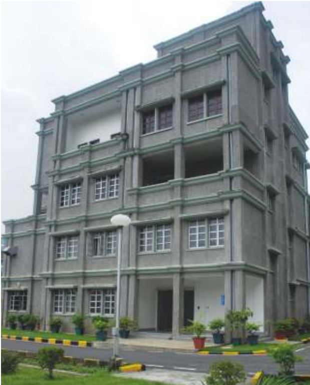
CSSTEAP HQ Dehradun

capability in the Asia-Pacific countries for research and applications in the core disciplines of Remote Sensing & Geographic Information System, Satellite Communications, Satellite Meteorology & Global Climate, Space & Atmospheric Science and Global Navigation Satellite System (GNSS). The educational programs, with course curricula developed by the United Nations, are recognized by Andhra University, Visakhapatnam, India for award of M.Tech degree. About 2139 professionals from 55 countries within and outside the Asia-Pacific region have graduated so far from the centre. For further details you may please visit www.cssteap.org .