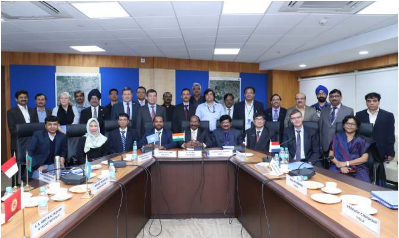
Governing Board Members and Special Invitees during 23 rd Governing Board Meeting at Delhi on December 10,2018