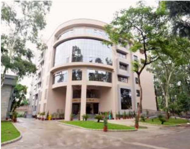
Golden Jubilee Hostel at IIRS