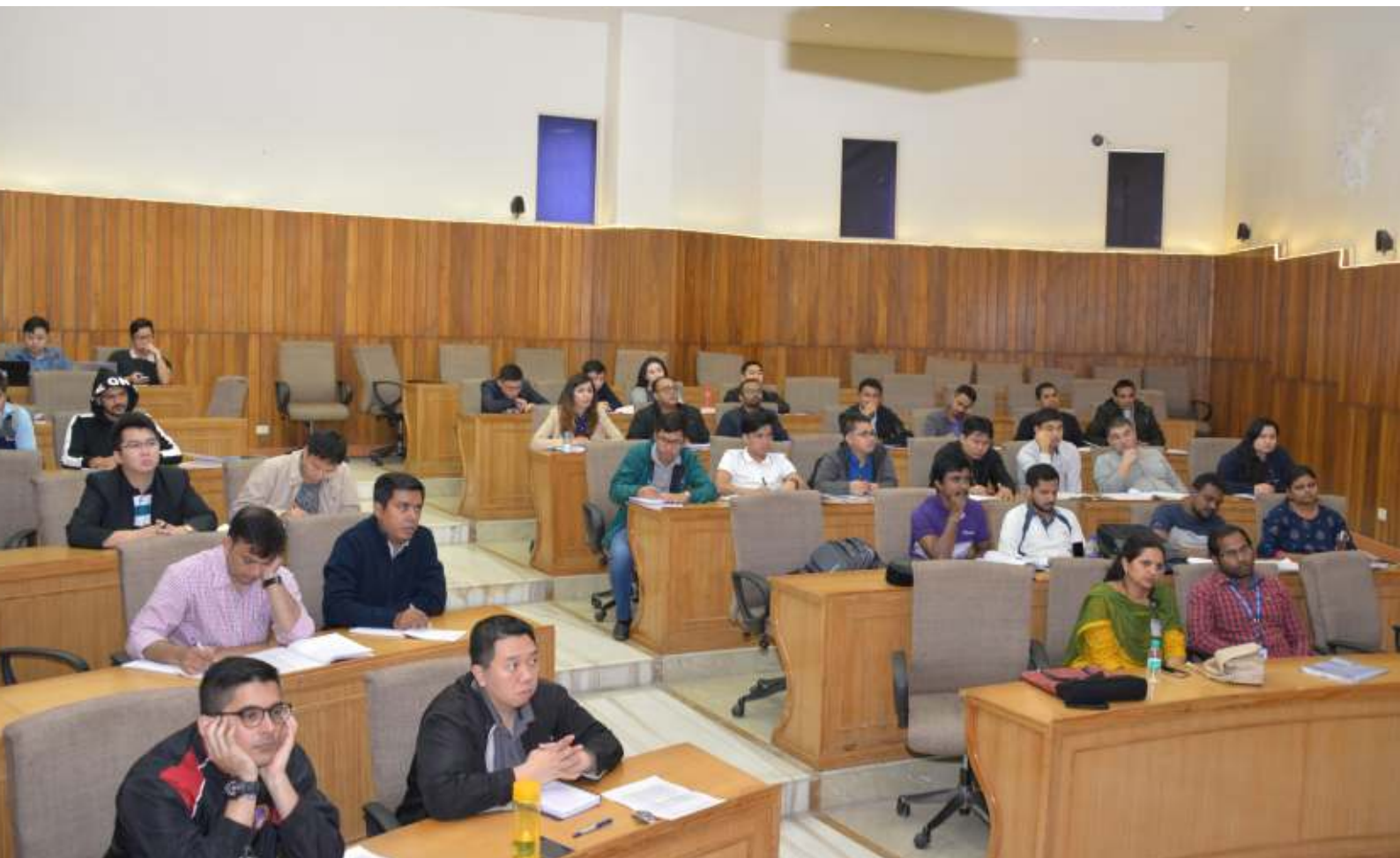
SSM 2018 course participants in classroom

Selected participants will be intimated by email and a formal letter.