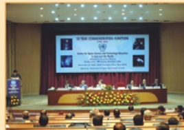
Ten year commemoration function of CSSTEAP in progress