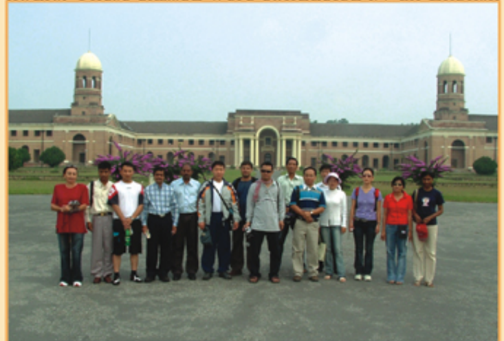
Participants at Forest Research Institute (FRI), Dehradun during local field excursion

To improve the English Communication and writing skill of the course participants, evening English classes were also organized beyond office hours. These classed were conducted by an English