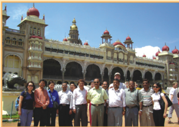
Participants at the Mysore palace

aspects of Satellite Communication Systems were covered by experts from SAC. The presentations on various Satellite sub systems, well supported by the practical demonstrations at ISAC Bangalore were