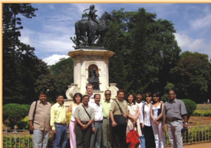
Participants in Lalbag garden in Bangalore

After going through a rigorous schedule for the last 7 weeks the participants got the first break and left to the South of India on their first technical study tour on 23 rd September 2005. Participants visited ISRO Satellite Centre (ISAC), Bangalore, Master Control Facility (MCF), of ISRO in Hassan, ISRO Tracking Station (ISTRAC) at Bangalore and Mr. Abdul Nazir Sab State Institute of Development in Mysore. The Lectures on Satellite sub-systems were arranged in ISAC, Bangalore where most of the design & developments of Satellite sub systems are carried out. In all these centres the participants' were accorded cordial reception and got the flavour of the ISRO's space programmes, the work culture and hospitality. As a part of the study tour the