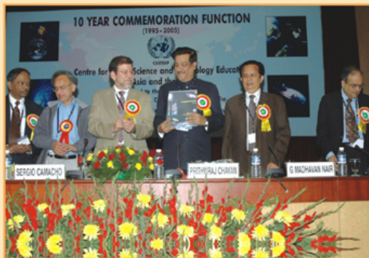
Release of Souvenir by chief Guest-Mr. Prithviraj Chavan, Hon'ble Minister of state in the Prime Minister's office

note address on the occasion. He applauded the role that CSSTEAP has played in the past years and raised the level of commitment of India towards creating a better world where sharing of knowledge and improved society lives. The initiatives of UN in the activities of the CSSTEAP was appreciated.