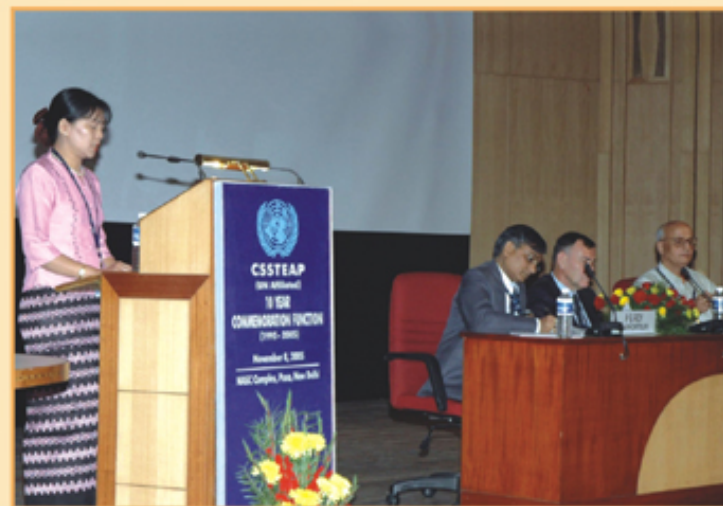
Past RS & GIS course participant from Myanmar giving feed back