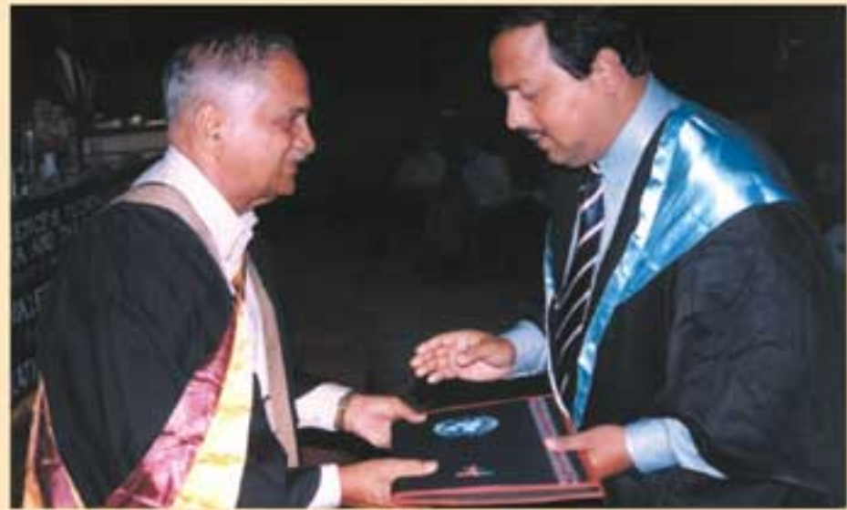
Students receiving PG Diploma Certificates from Chief Guest

Then the participants proceeded to Prof. Satish Dhawan Space Centre (SDSC), Sriharikota, the launching pad of Rockets in India. It was a dream come true for many participants to see the massive