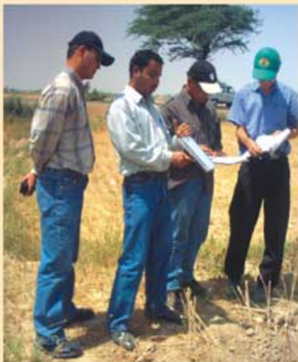
Field data collection for pilot project

The Eighth Post Graduate Course on Remote Sensing and Geographic Information System (RS & GIS) which commenced on October 1, 2003 is in progress at Indian Institute of Remote Sensing (IIRS), Dehradun. 21 participants from 16 countries of Asia-Pacific region are attending the course. The course is ending on June 28, 2004, with a valedictory function. The three months Module-III which started from April, 2004, is basically designed for carrying out pilot project work by the course participants. The objective of this module is to make the course participant independent and capable to carry out research on their own towards accomplishment of natural resources inventory and