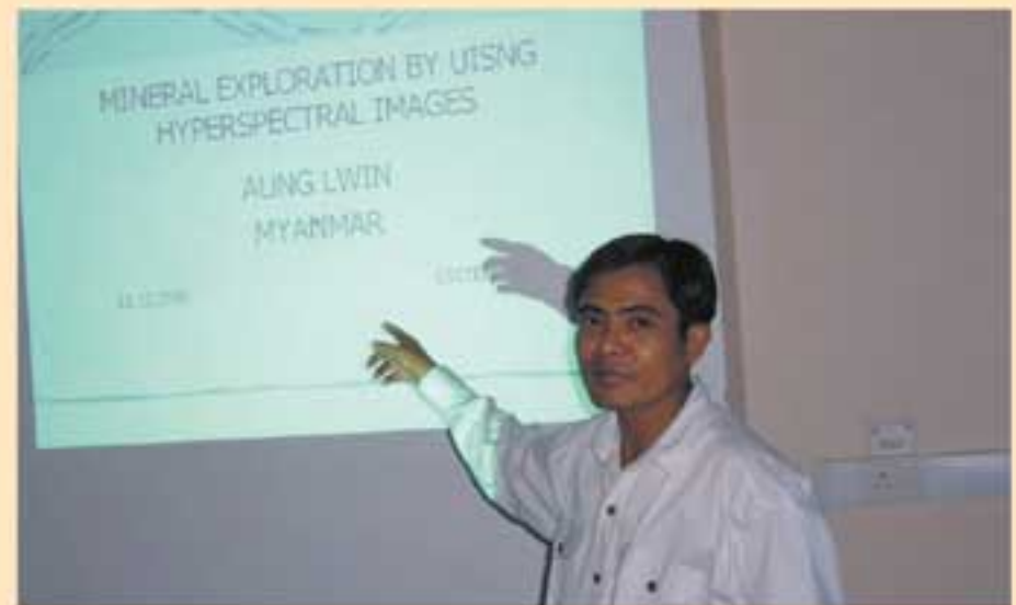
Participant making Seminar presentation

management. The topics of the pilot projects were chosen by the course participants based on their area of interest, interest of parent organizations of the participants, expertise available at IIRS etc. The broad topics of the pilot projects