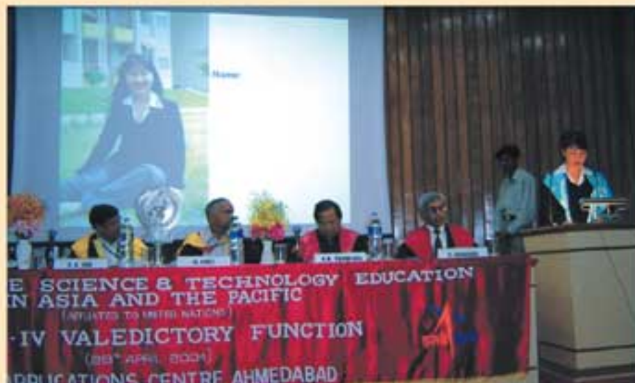
Valedictory function of 4th SATCOM PG course