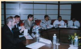
AC Meeting in progress