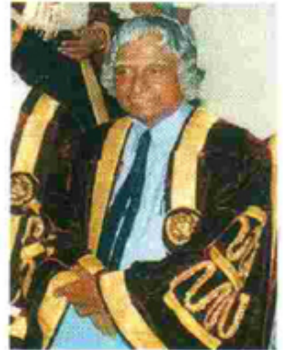
Bharat Ratra: Dr. A P J Abdul Kalam at valedictory function of Remote Sensing and Geographic Information System Course at IIRS, Dehra Dun